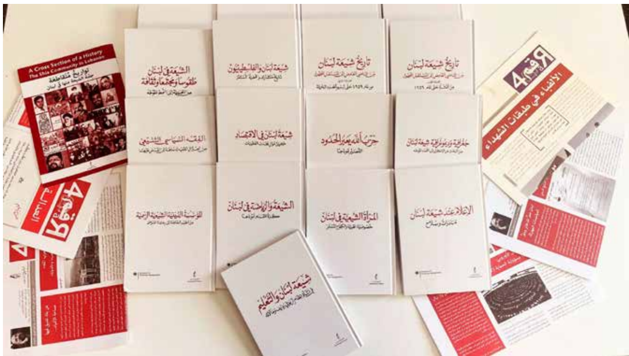
The Encyclopedia of Shiite History.