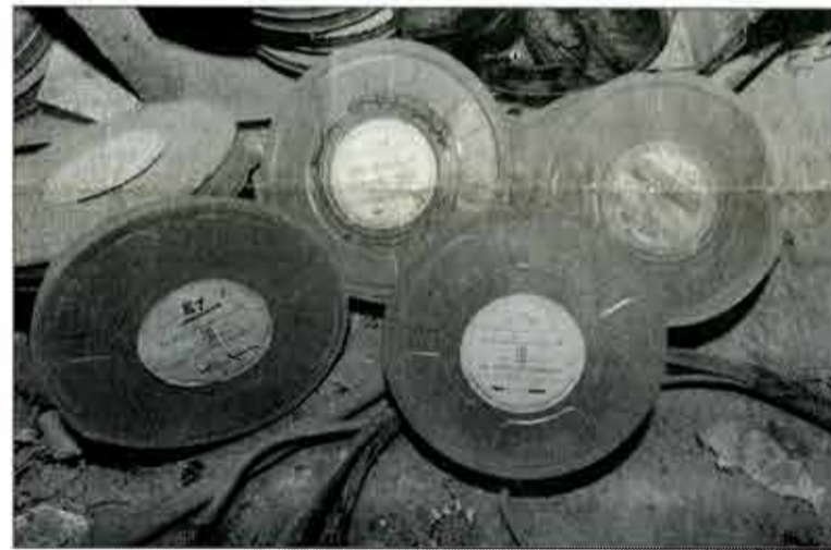
UMAM team rushed to the site, where they began to collect documents and film reels.