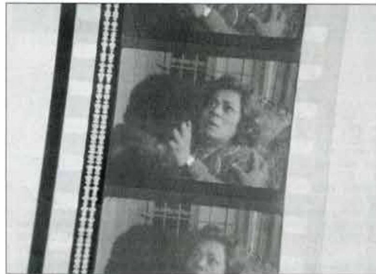
The film reels represent a significant part of the country's audiovisual patrimony.

The problem, Borgmann explains three years on, is that the machinery needed to digitize the damaged film doesn't exist in Lebanon, and state support and funding for cultural projects is almost nonexistent.