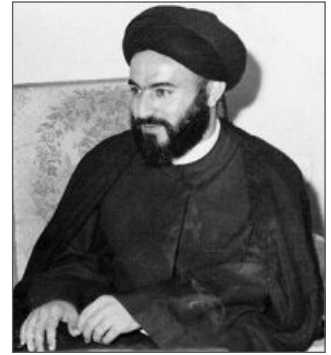
The Alawis are the Shia of Ahlu-l-bayt