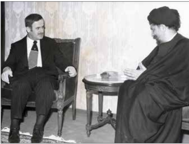
Sayyed Musa Sadr and Hafez Assad, March 11, 1975