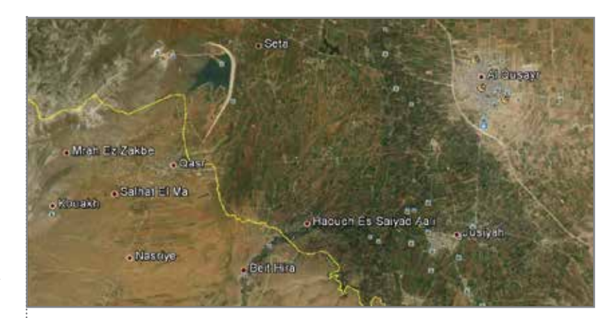
On February 21, several media outlets released an FSA statement which claimed:

In the weeks that followed, tensions continued to mount in Orsal before they eventually peaked on Friday, February 15 when nearly 100 demonstrators blocked a road with flaming tires to protest the presence of army reinforcements.<sup>12</sup> In fact, Sunni leaders have differed on how they should respond to the incident, as many of the moderate principals are hesitant about providing too much support to potential Islamists. Though former Prime Minister Saad Hariri condemned the events, he also urged Orsal residents to cooperate with the military and stressed the importance of allowing "justice to take its course and [preserving] the image of the military institution."13 Prime Minister Najib Mikati, similarly reserved in his criticism