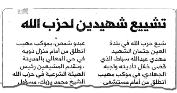
Al-Balad announcement of the funeral of two Hezbollah shaheeds.

men were officially designated as martyrs and received highly ceremonial and dignified funerals for having died in a car crash , that outcome begs the question why untold numbers of other young men