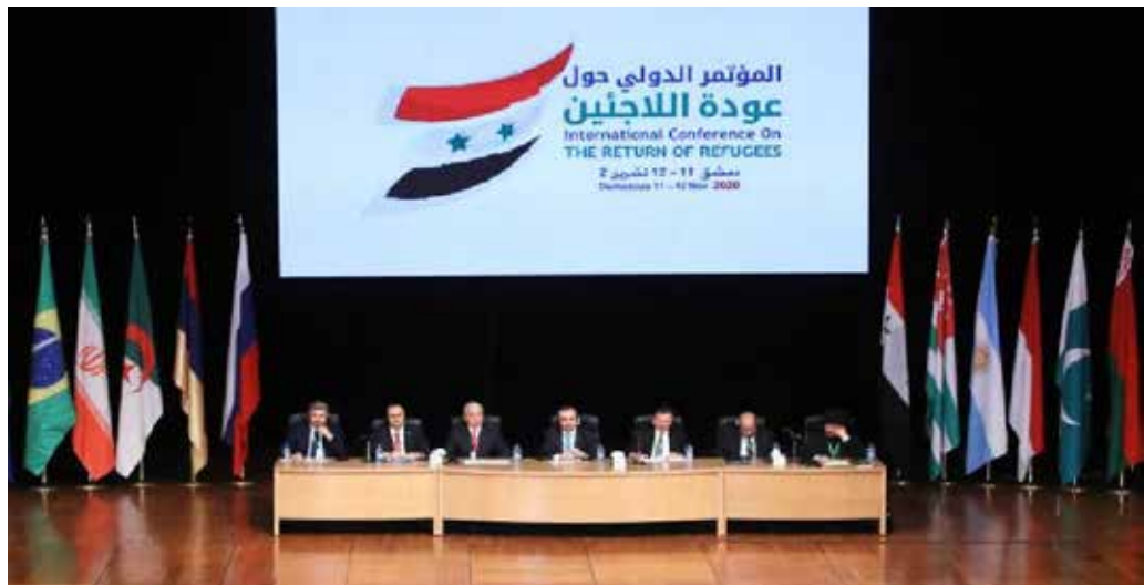
While Lebanon continues to refuse to the Syrian refugees the legal status of "refugees," preferring instead to lock them in the blurry category of "displaced" ( nazihoun ), it still enthusiastically took part in the Russian-backed, Damascus-hosted "International Conference on the Return of Refugees."