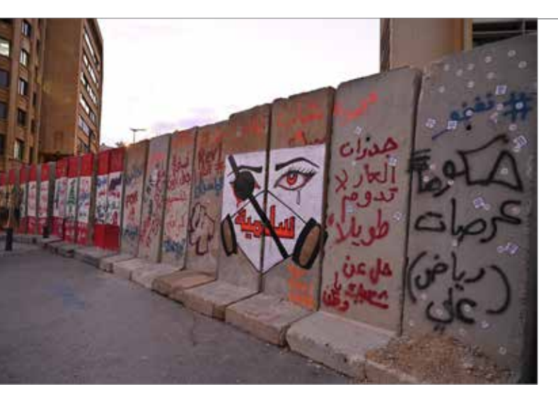
A stretch of the wall in Downtown Beirut that secures the parliament and Grand Serail. The graffiti on the second cement panel to the right reads: "The Walls of Infamy are short-lived."

Anyone taking a walk nowadays in Downtown Beirut, the beacon of the popular protests which broke out on the evening of October 17, 2019 to oppose a governmental decision to impose a tax on WhatsApp calls and other VoIP services, could find themselves believing that this district of the city is orderly divided into two segments by tall, reinforced cement panels and other security