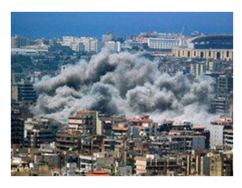
During the 2006 Lebanese War, the Israeli Air Force reduced entire streets to rubble and ash. Today, the Hezbollah-dominated quarter of Beirut is also home to the "Hangar" gallery

Haret Hreik is also home to "The Hangar", one of the city's most ambitious gallery projects. Originally a huge hangar providing catering services for the nearby international airport, these days it accommodates the eponymous gallery.